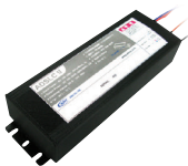
ADSLC II (DPST 2FORM Y)