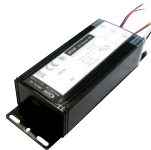
ADSLG (SPST 1FORM A)